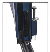
Integrated shoot - bolts

CONTATTACI PER AVERE INFORMAZIONI: INFO@ATF-AUTOMATION.CH - 091 682 96 06