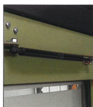
"Stabilus" gas door stays